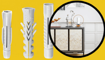
NYLON PLUGS 6mm - 20mm