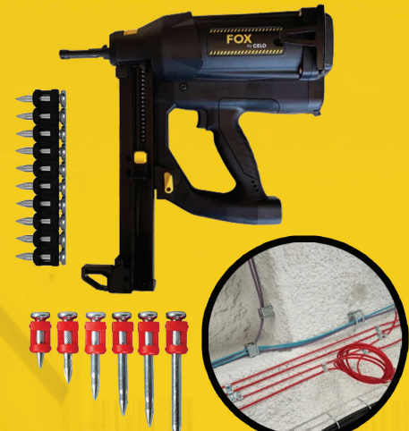
GAS NAILER & NAILS 13mm - 40mm