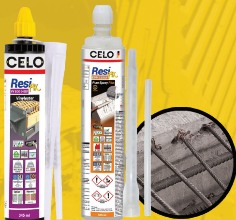
CHEMICAL ANCHORING PRODUCTS