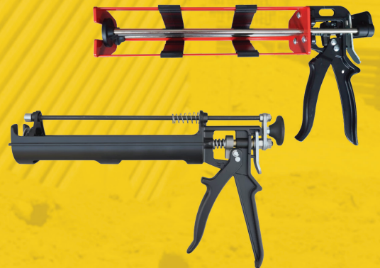
MANUAL DISPENSER GUN